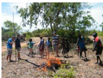
Straightening spears in the fire