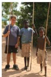
Some proud boys with their spears

While the boys were busy with their 'men's business', the girls also took the opportunity to try their hand at some traditional arts and crafts. We took it a bit easier than the boys and sat on the ground, in the cool breeze for several hours while we leisurely made our own hair paintbrushes and practiced the traditional painting technique of cross-hatching. When the tide was low we collected small shells from the beach and cleaned and prepared them for jewellery making. As we sat together, chatting and enjoying each others company the girls made beautiful memory bracelets and necklaces. The short time together was a great opportunity for our students to teach and share in the enjoyment of activities that are part of everyday life here in Gawa. New friendships made and fabulous memories to take home!