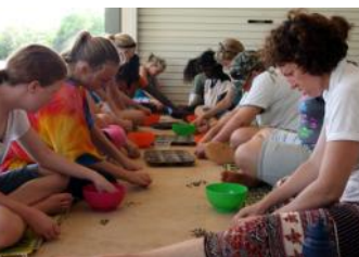
The girls working together

While the boys were busy with their 'men's business', the girls also took the opportunity to try their hand at some traditional arts and crafts. We took it a bit easier than the boys and sat on the ground, in the cool breeze for several hours while we leisurely made our own hair paintbrushes and practiced the traditional painting technique of cross-hatching. When the tide was low we collected small shells from the beach and cleaned and prepared them for jewellery making. As we sat together, chatting and enjoying each others company the girls made beautiful memory bracelets and necklaces. The short time together was a great opportunity for our students to teach and share in the enjoyment of activities that are part of everyday life here in Gawa. New friendships made and fabulous memories to take home!