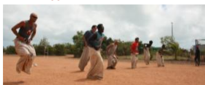
Men's Sack Race