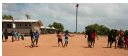
Three Legged Race