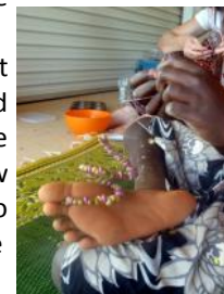
Making use of whatever was handy while threading bracelets!