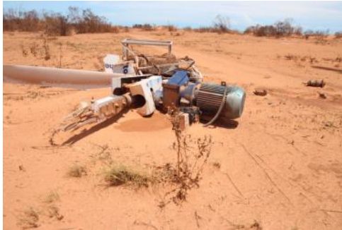
Motor and blades of our wind turbine