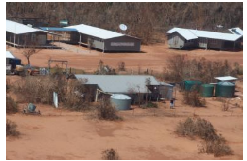
Classrooms and school housing