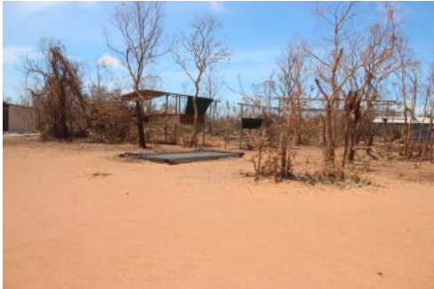
Our playground was stripped bare of vegetation