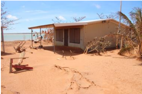
The force of the wind blasted our houses with sand and salt water that forced its way inside