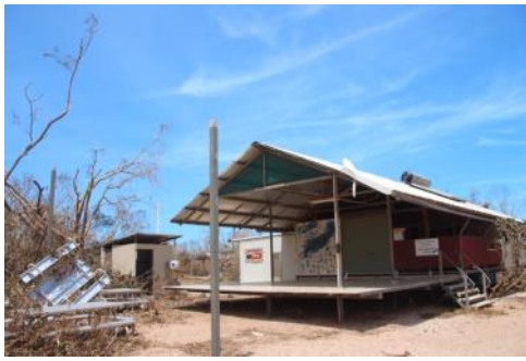
School kitchen and outdoor seating