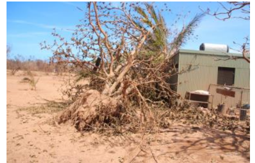
Many large trees were uprooted