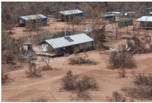
School kitchen and outbuildings